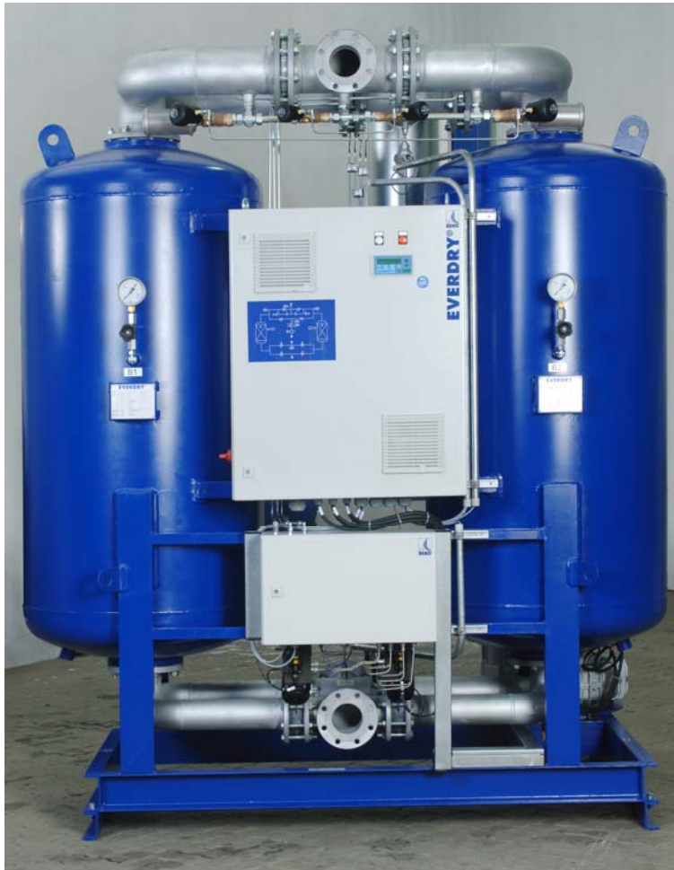
Construction from Standard Type Size 3400